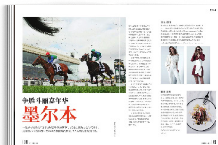
EXCLUSIVE CHINESE DESTINATION FEATURES