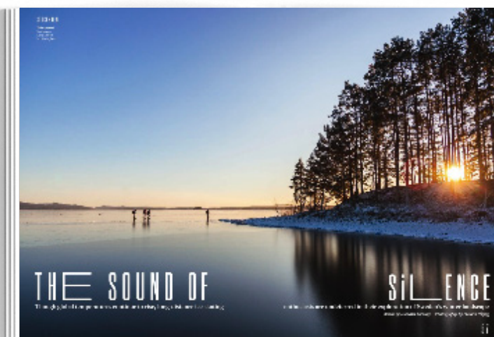
RICH, IMMERSIVE STORIES FEATURING BESPOKE PHOTOGRAPHY